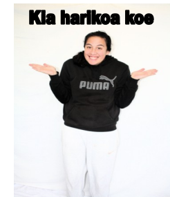
TE REO MAAORI